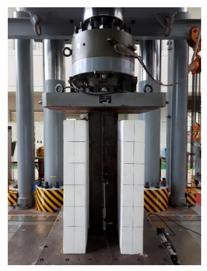
Fig. 2 Push-out test set up with UTM